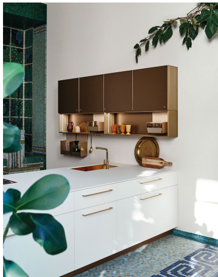
Maxima 2.2 by Cesar

Another new composition that took stage in the show was N_Elle , in which the simple composition of the Maxima kitchen is joined to Dressup line with an elegant white finish