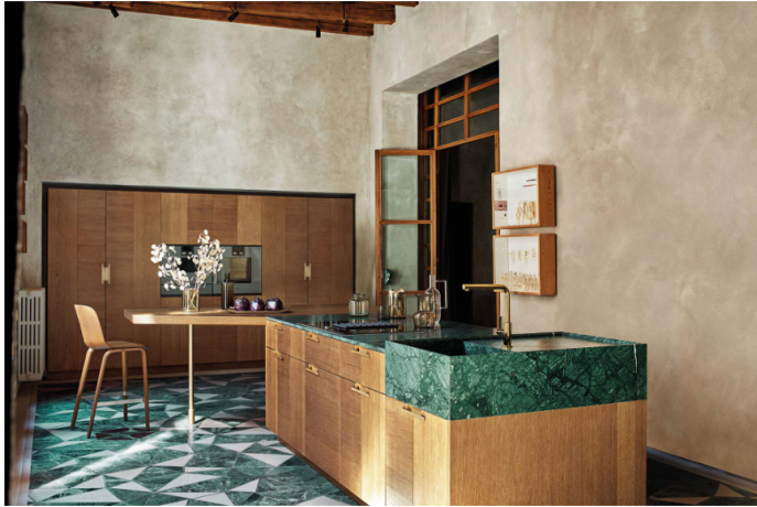
Intarsio - Rovere Mediterraneo

Discarding rigid linearity, Cesar introduced sinuosity with Tangram , a project influenced by the modular logic of the ancient Chinese game of geometric shapes that can be configured in numerous ways. Accentuating the fluidity of the composition, the cabinet door showcases a special 3D detail called Groove, and the double-sided Tangram cupboard divides the environment into kitchen and living room areas. The 50's , with its expansive customisation possibilities, is the contemporary reimagining of a 1950s-era library and storage system. In an open domestic environment sans walls, it is a fit for the kitchen, dining room, and the living room areas.