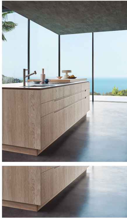
N_Elle by Cesar

The airy composition, novel colours, and elegant visuals characterised the space exhibiting Intarsio , a design available not only in wood finish, but also in bright structured lacquer as well. Inspired by the deconstruction of the two-dimensional surface of a door, the stark contrast between vertical and horizontal lines of the contemporary design sets it apart. Meanwhile, the living room and dining room areas were embellished with an authentic arrangement of Dressup which displays its compositional flexibility: the modules, rather than being placed side by side in a single block, are "exploded" and interspersed freely in the space to highlight the options and uses of the product design . The system encompasses the variation, Dressup Line , which does the linear development of the splashback and shelving combinations and an intriguing artistic element from the Art Collection , that presents the picturesque and refined still life works of Venetian photographer Zaira Zarotti.