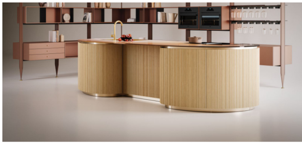
ABOVE The 50's system and the Tangram kitchen island

Inspired by the ancient Chinese puzzle game of the same name, Tangram brings a unique blend of modular composition and fluid design to kitchen spaces.