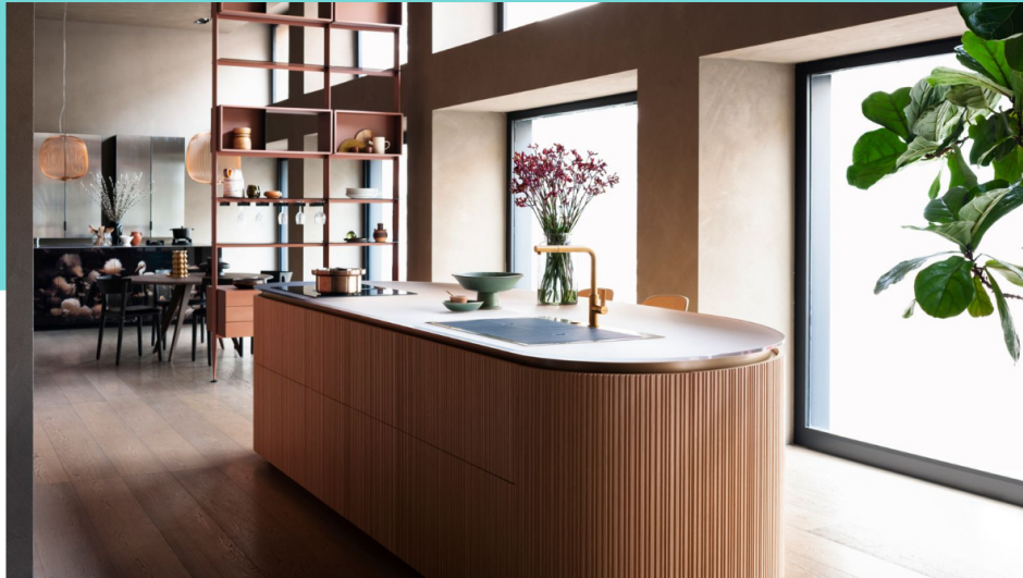
COVER Artistic appeal meets modularity and modern design in the Cesar Tangram kitchen island