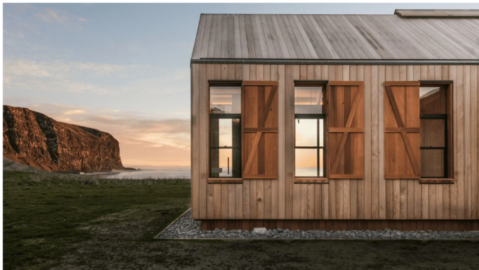
COVER The Scrubby Bay cabin at Annandale in New Zealand